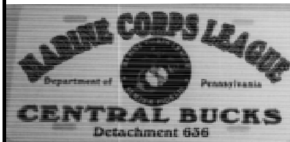
DETACHMENT LICENSE PLATE