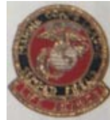
LIFE MEMBER BLAZER CREST