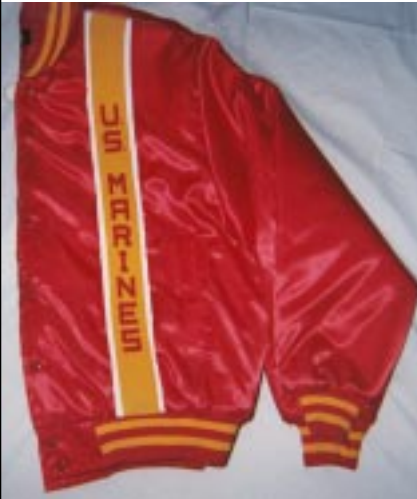
USMC SATIN JACKET