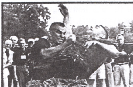
MARINES PRACTICING KUNG-FU

The gray belt is the next step up and shows Marines have learned techniques such as lower-body strikes, chokes and how to get out of a headlock, he said.