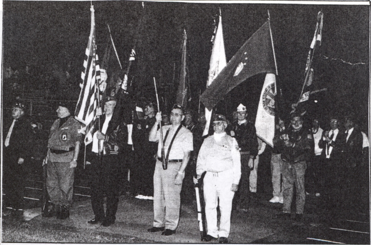
Veterans from area groups, including the American Legion Post 210 of Doylestown, Veterans of Foreign Wars Post 175 of Doylestown, Vietnam Veterans of American, Chapter 210 of Doylestown, and Central Bucks Detachment Marine Corps League , prepare to march onto War Memorial Field to be honored during the sixth annual Band Night.