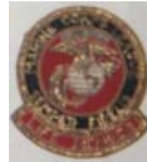
LIFE MEMBER BLAZER CREST