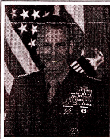
GENERAL PETER PACE Chairman, Joint Chiefs of Staff

In 1968, upon completion of The Basic School, Quantico, Gen. Pace was assigned to the 2nd Battalion, 5th Marines, 1st Marine Division, in the Republic of Vietnam,