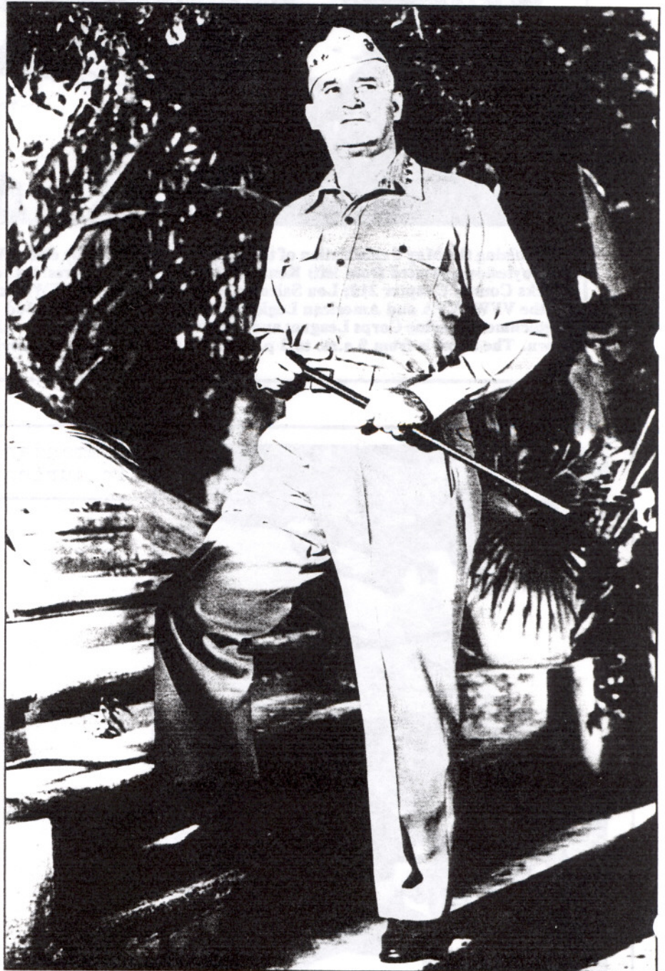
LtGen A.A. Vandegrift, Marine hero and later Commandant.

The general died at the age of 86. The main east-west road is named Vandegrift Boulevard in his honor.