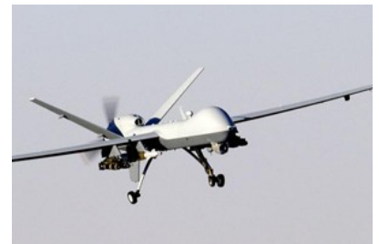
A drone used in modern warfare piloted from the States.