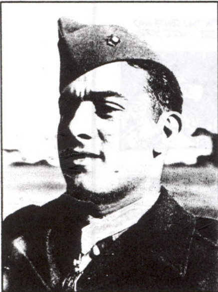
Medal of Honor encircles hero's neck.

DATELINE: GUADALCANAL At 9:30 p.m. Oct. 24, 1942, thousands of Japanese attacked 600 Marines of First Battalion, Seventh Marine Regiment, shouting at the Americans, yelling in English, "Blood for the Emperor! Marine, you die!" The order came from Colonel Lewis B. (Chesty) Puller: "Commence firing!" It was an order that was to be obeyed almost non-stop for three days. The massive offensive faced by 26-year-old Sgt. John Basilone and his battalion continued nonstop for 72 hours. The extraordinary bravery and tenacity shown by the American troops, who in that weekend defeated an estimated 15,000 Japanese soldiers, changed the course of World War II. It