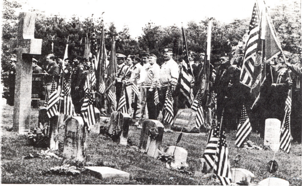
Members of the Vietnam Veterans of America, Veterans of Foreign Wars, American Legion, and Marine Corps were present at the Memorial Day ceremonies at the Doylestown Cemetery.