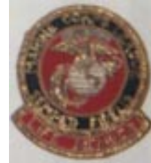
LIFE MEMBER BLAZER CREST