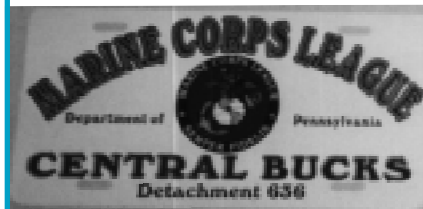
DETACHMENT LICENSE PLATE