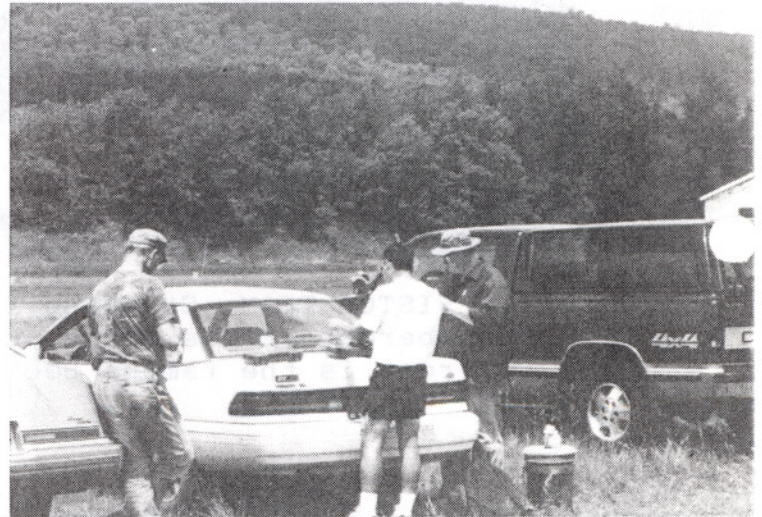
The team stops for lunch with the Pennsylvania hills in the background.