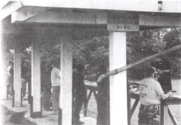
The firing line at the pistol match. No bellies allowed on the table while you shoot!