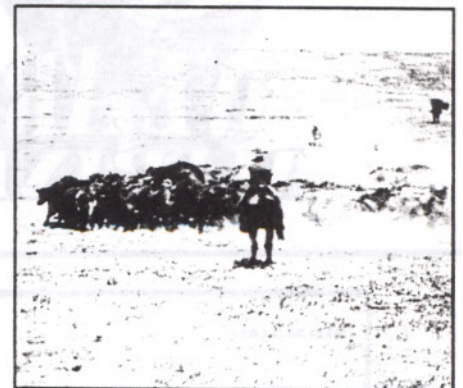
Cattle, crops were mainstay here.

The Santa Margarita Ranch was then transformed into one of the largest military camps in the United States as a West Coast base for combat training of Marines and the preserving of California's resources.