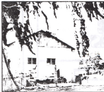
Shed now is site of Ranch House Chapel.