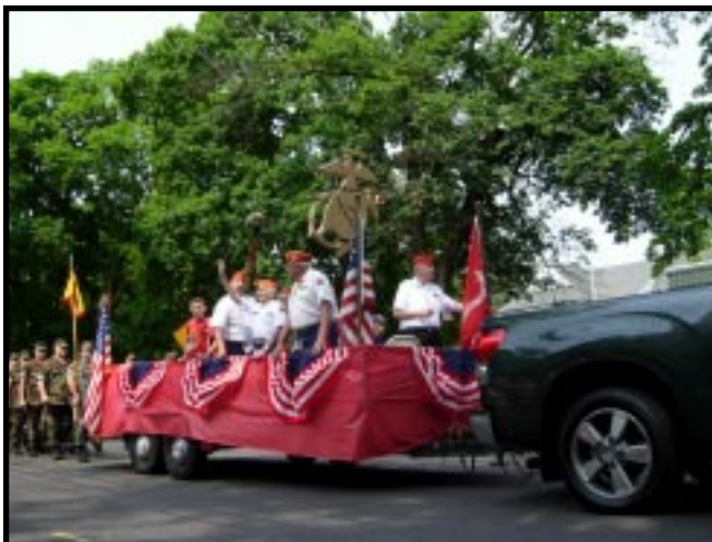
PARADE CONTINGENT-- Detachment members aboard the float followed by the Young Marines Unit.