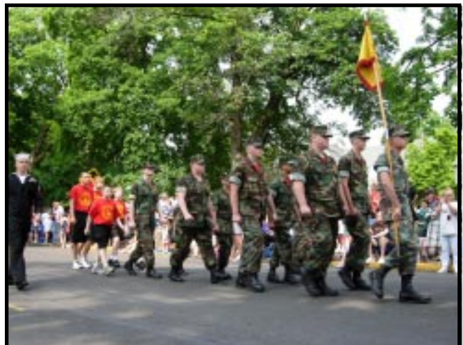
YOUNG MARINES UNIT-- Our Young Marines Unit strutting their stuff while marching behind the Detachment float.