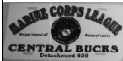
DETACHMENT LICENSE PLATE