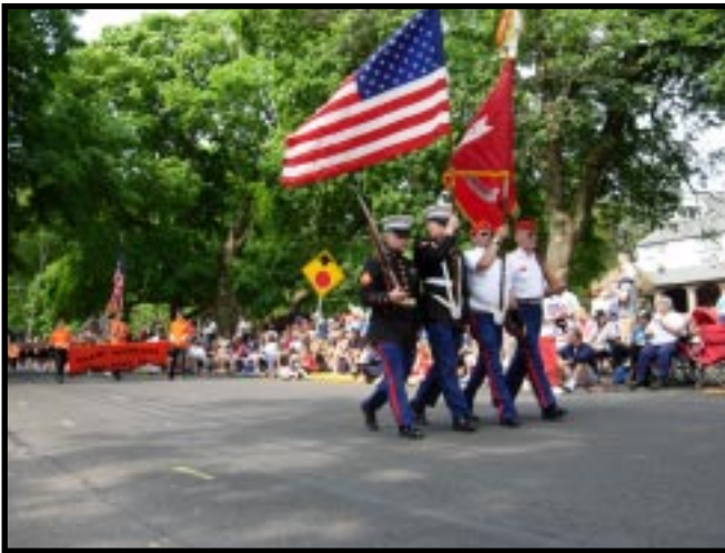
COLOR GUARD-- The Central Bucks Detachment Color Guard leading Doylestown's 143rd Annual Memorial Day Parade.