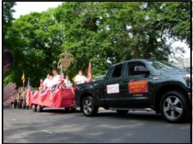
DETACHMENT FLOAT-- Detachment members aboard the long-serving float.