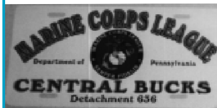
DETACHMENT LICENSE PLATE