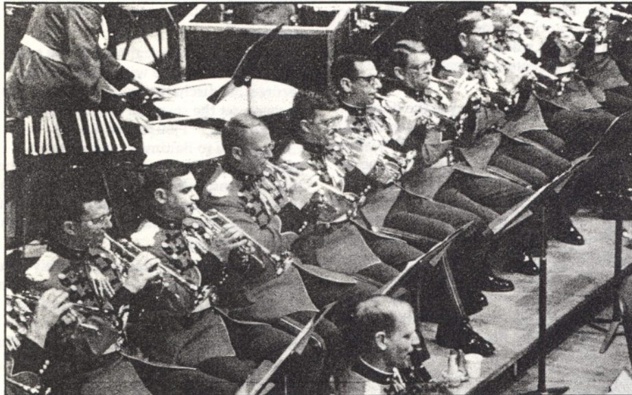
The cornet and trumpet sections in performance during last year's Kennedy Center concert.