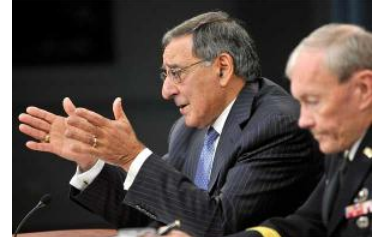
Defense Secretary Leon Panetta

Panetta outlined how the convergence of three deadlines in March threatens to "hollow out" the military. He explained that the March 1 deadline to determine sequestration cuts, the expiration of the Continuing Resolution that's funds the Defense Department, and the debt ceiling debate will work in confluence. Panetta called it a "perfect storm of budget uncertainty."