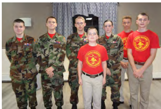
Liberty Young Marines in attendance for the cake cutting