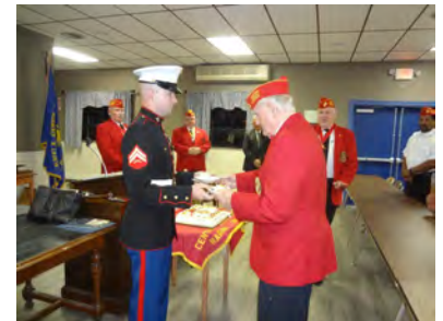
The oldest and youngest Marine present share cake