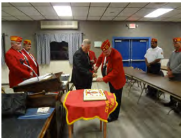
Guest of Honor and Commandant cut the cake