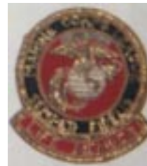
LIFE MEMBER BLAZER CREST