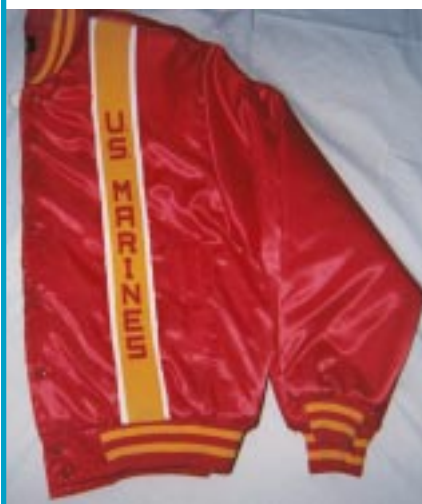
USMC SATIN JACKET