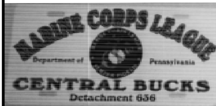
DETACHMENT LICENSE PLATE