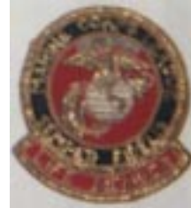
LIFE MEMBER BLAZER CREST