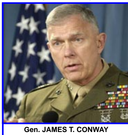
Gen. JAMES T. CONWAY