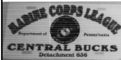
DETACHMENT LICENSE PLATE